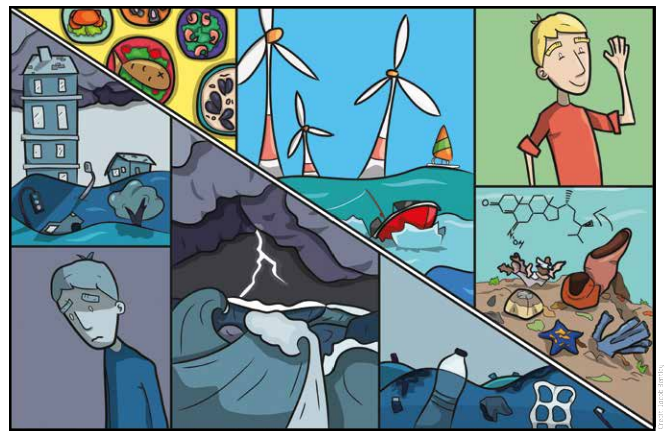
Human activities that impact the ocean in turn impact human health. These impacts can be beneficial, such as those from food, renewable energy, recreation, and biomedical research, but can also be negative, such as those associated with floods, storms, and pollution.

The 2014 Message from Bedruthan<sup>3</sup> called for a review of the OHH policy landscape. The policy report<sup>4</sup> and Strategic Research Agenda<sup>5</sup> (see box overleaf), which form the basis for this Policy Brief, arise from that call.