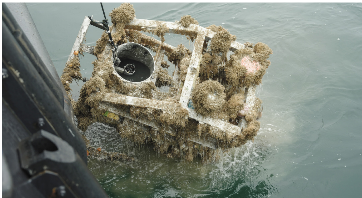
Acoustic equipment being retrieved with VLIZ acoustic team, North Sea, 2024