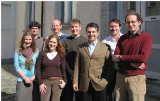
Working Group members, March 2011, Leuven

Stakeholder engagement during Position Paper preparation: To seek stakeholder perspectives for the Position Paper, WG members designed a feedback form and identified target stakeholders from national authorities (agencies, ministries) in charge of MPA management. The consultation was launched in October 2010 and stakeholder responses provided key information on MPA development at National level. Further stakeholders were also identified including the Regional Sea Conventions as key targets developing and coordinating regional strategies for MPAs and